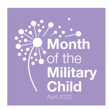
April 2022—Breaking News!

Please hold the dates: 22 June & 8 July.