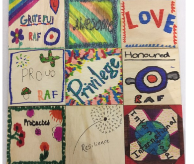
'Today's conference was spectacular. I would like all schools to be more supportive of people when their mums and dads are away.' (11 year-old)