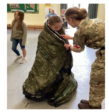
June 2022—Celebrating Armed Forces Day at St John's the Evangelist, Carterton